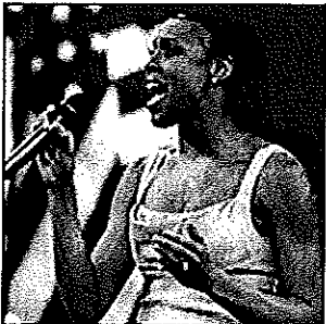
Tribute to Althea