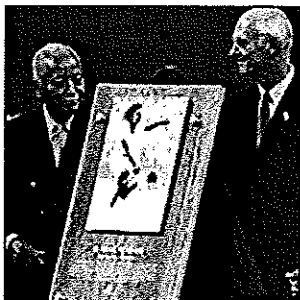
Gibson The Great

On a night when 22-year-old Serena Williams looked to move forward in earning her second Open title in the last five years, Althea Gibson, based on her barrier-breaking feats some 50-years before, was memorialized in a pre-game ceremony as the "African-American Mother of Tennis."